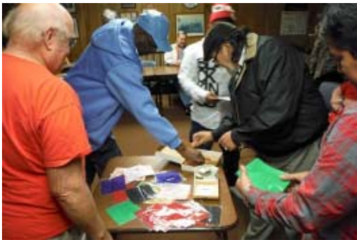
Members grab their supplies before the workshop

The first effect taught was the Color Changing Silk, or as it is sometimes called, the Chameleon Silk. This effect duplicates the classic trick that uses a dye tube for the switch. Jerry offered several bits of advice on using a thumb tip effectively, and handed out tips to everyone for some practice.