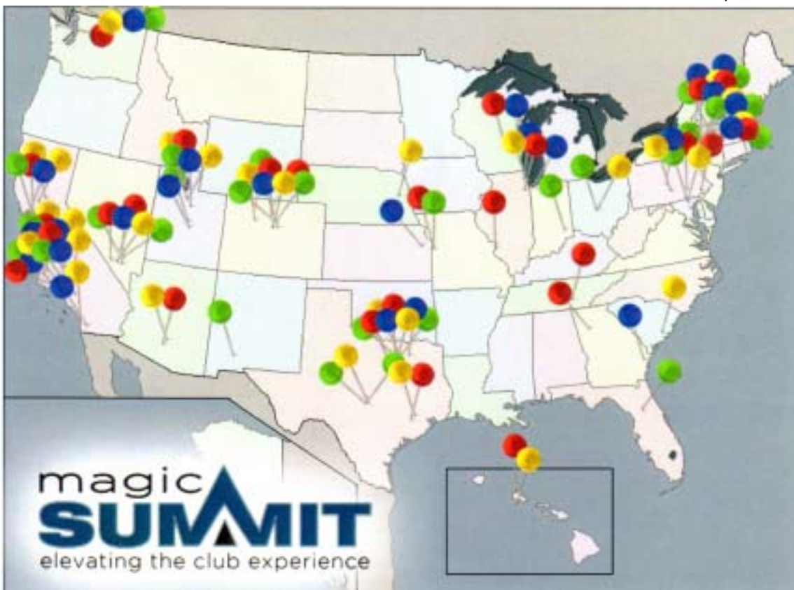
Participants came from around the country